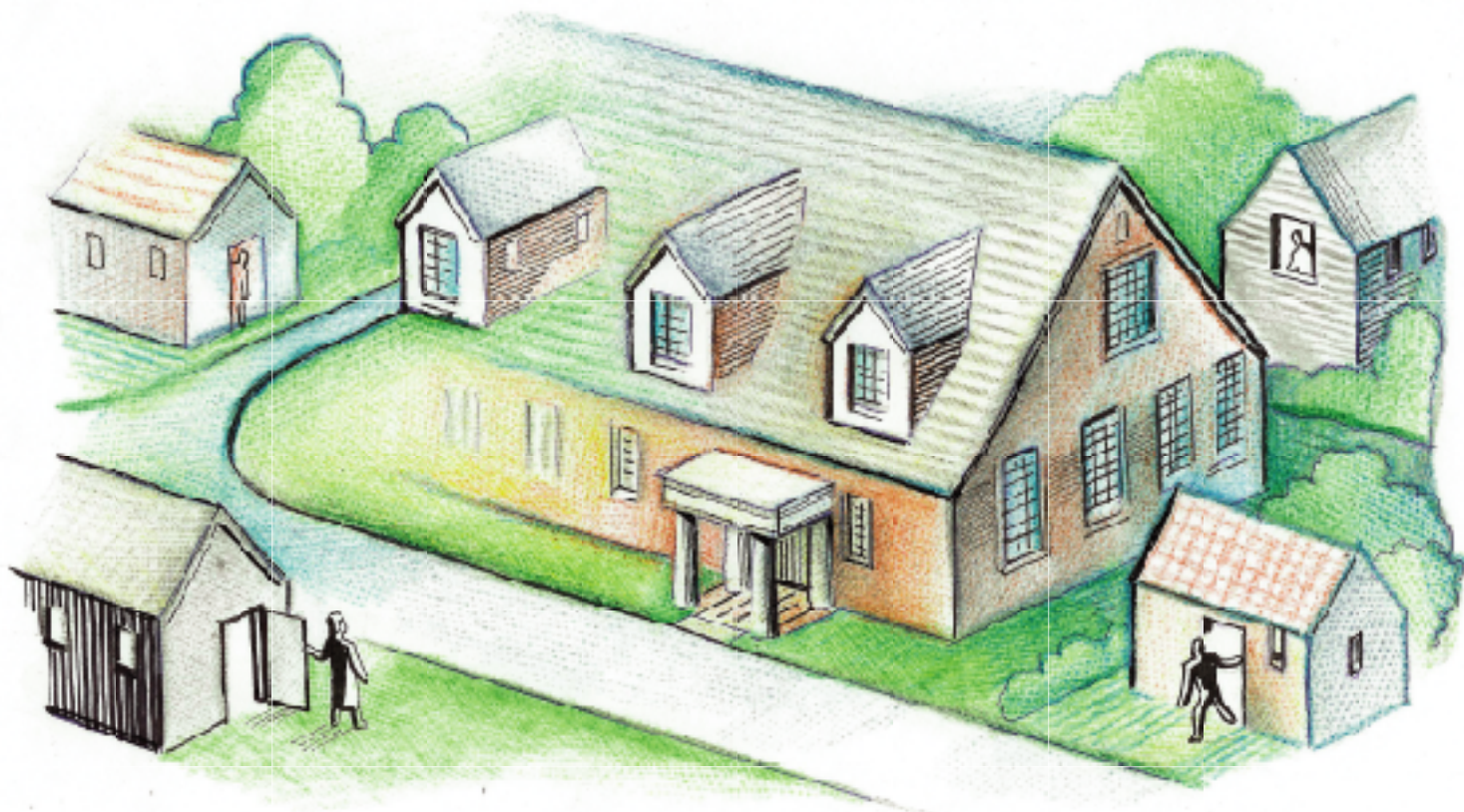
ILLUSTRATION BY DAVID SUTER

Of course, not all demolished houses are historic. Many are obsolete relics